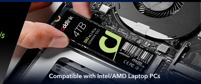
Compatible with Intel/AMD Laptop PCs